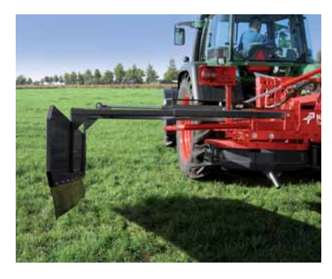
Silodisk VARIO offers hydraulic adjustment of the swath board for working widths up to 6 m.