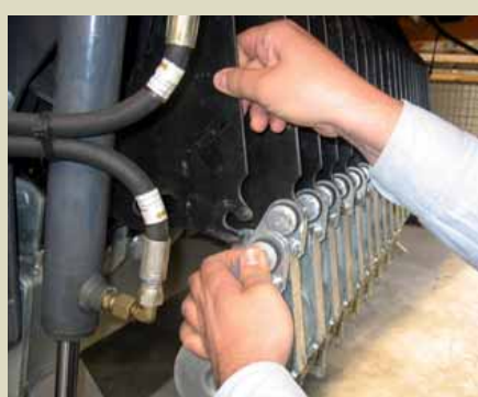
The knives are quickly released and changed.