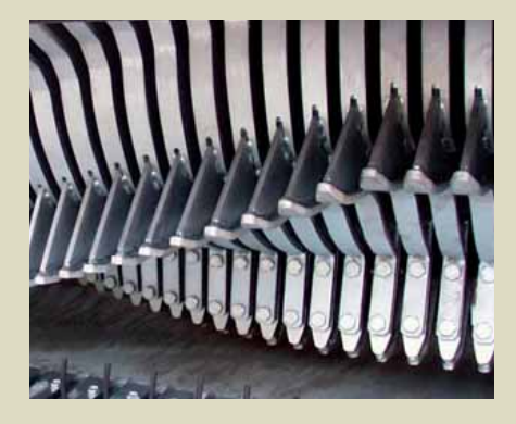
Strong loading rotor with low power requirement and high intake capacity.