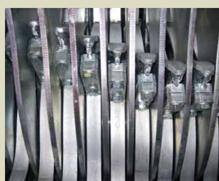
The input tines can be easily changed by releasing the bolt.