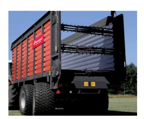
Two distribution rollers available for 12040, 1245 and 12050 for an even more efficient unloading.

Kverneland Taarup 12055 with a capacity of 55 m<sup>3</sup> and 34 tons.