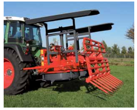
Silodisk VARIO can be fitted with a silo fork.

The Silodisk VARIO comes standard fitted with lighting kit. It can also be fitted with a silo fork, to divide large quantities of crop better across the clamp, or bring it onto the clamp, if unloading takes place in front of it.