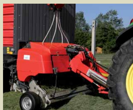
The large 1.85 m pickup with roller crop guard for a smoother material flow.