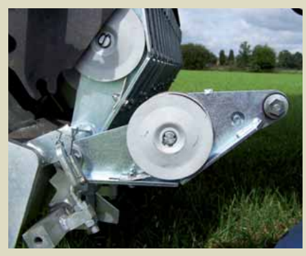
The knives are individually protected against foreign obstacles.