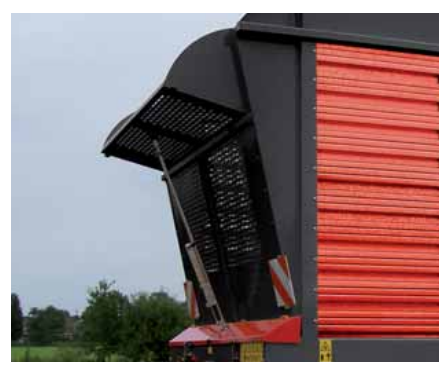
A straight front panel with a manually adjustable front flap. Hydraulic operation is available as option.