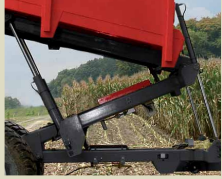
Hydraulically hoisted container using four scissor-action cylinders.