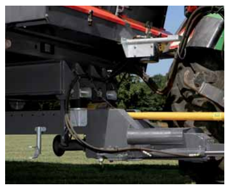
Sprung drawbar with rubber blocks.