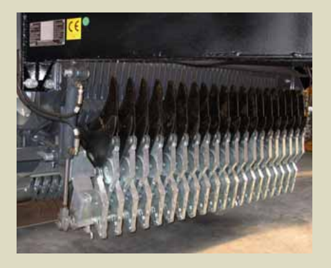
Chop length can be easily set for 38 or 76 mm.

The specially designed pickup offers silent operation, due to the perfectly milled curve track. The pick-up has a width of 1.85 m and 6 rows of feeding teeth, each fitted with 30 teeth (54 mm spacing), preventing crop loss and ensuring that every haulm from even the heaviest swaths are raked up. The strong design of the tines prevents overload when lifting heavy crops. Large diameter, height adjustable pick-up wheels carry the pickup over every ground contour.